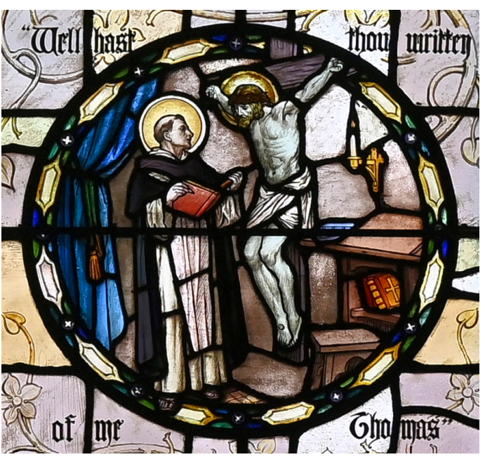
St. Thomas Aquinas window above the confessionals, St. Vincent Ferrer Church, New York City

As we conclude this Triple Jubilee, let's come together to celebrate this great saint of the Church. On Tuesday, January 28, at 6 PM at St. Vincent's, we will have a Solemn Mass in Honor of St. Thomas Aquinas. During the Triple Jubilee, attending any jubilee ceremony in honor of St. Thomas Aquinas allows a person the chance to receive a plenary indulgence. This, of course, is provided the normal conditions