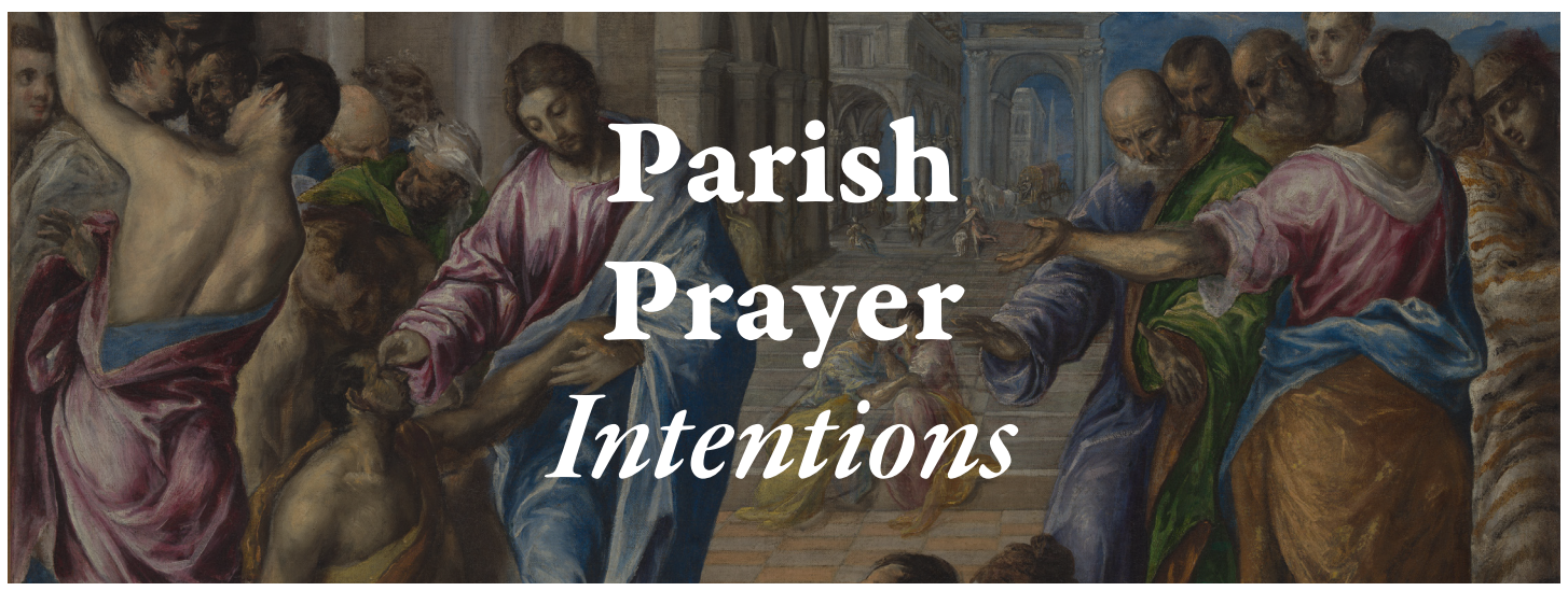
"Christ Healing the Blind," El Greco, 1570