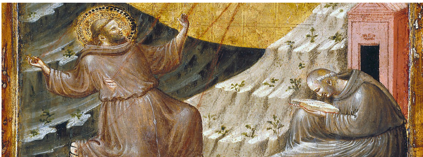
"St. Francis Receiving the Stigmata," Pietro da Rimini, circa 1330, Indianapolis Museum of Art at Newfields, Indianapolis