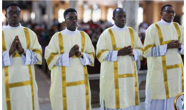
"First Diaconate Ordination," via the Catholic Diocese of Aguleri

This year's particular need is finding funds to train our seminarians in the seminary. We thank God that young people still want to offer themselves to proclaim the good news. The Catholic Diocese of Aguleri has 60 senior and over 250 junior seminarians. As a rural and riverine area, our new diocese needs to train its seminarians but lacks the resources to do so.