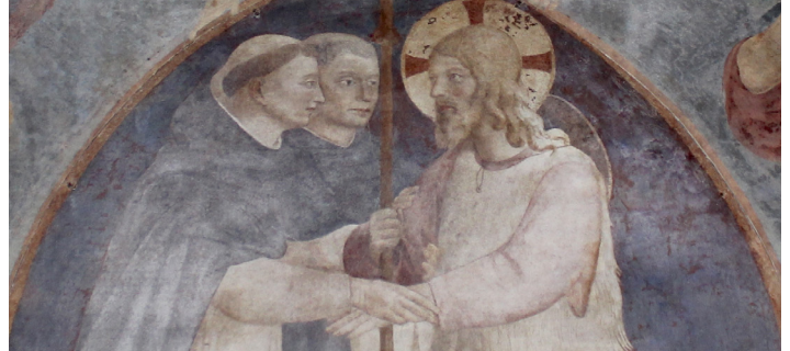
"Christ as Pilgrim Received by Two Dominicans," Bl. Fra Angelico, O.P., ~ 1442, San Marco, Florence

It is with this in mind that a group of parishioners is setting out on a pilgrimage to Washington, DC for the Dominican Rosary Pilgrimage at the end of the month. Through the intercession of the Blessed Mother, we hope to encounter the Lord in His saving mysteries as we reflect on and pray through the Rosary with His Blessed Mother. Through her prayers, the minds and hearts of the pilgrims can be more and more conformed to Christ's truth and charity. There are still a few more spots left on the bus, and this will also be an annual pilgrimage. If you would like to go, see page 7 for more details.