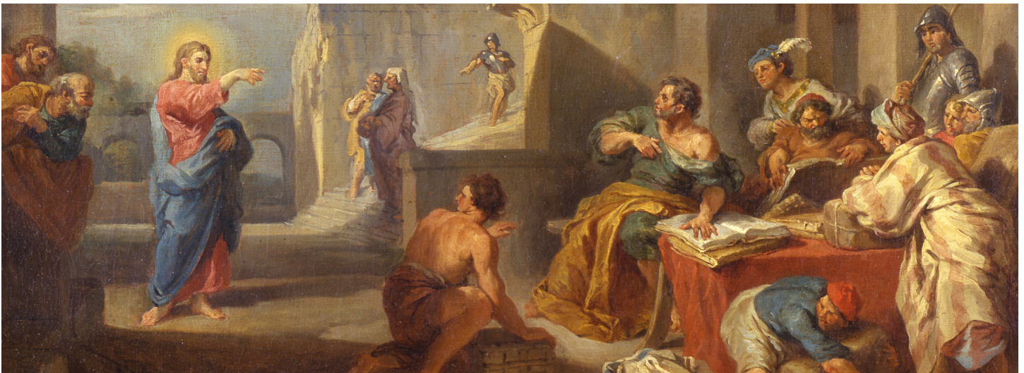
"The Calling of St. Matthew," Giovanni Paolo Panini, 1752, Museo Poldi Pezzoli, Milan