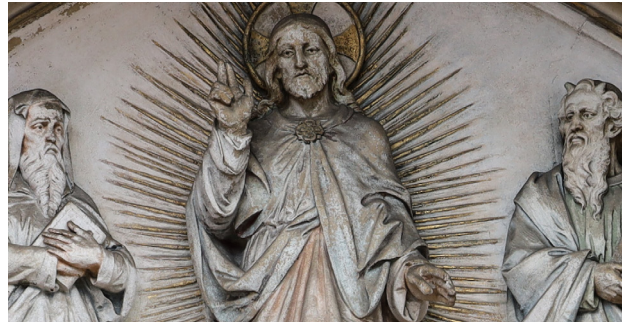
"Transfiguration of the Lord," Holy Trinity, Sloane Square, London

Yet, it was not just our minds and hearts that were being transfigured. The spaces in our buildings have also been receiving an overhaul. The most obvious is the confessional renovation at St. Vincent Ferrer. While this is not yet quite finished (please pray that the additional panes of glass that will reduce the sound and the visibility of the penitents come very soon!), we have almost completed it. We now have four functional confessionals, one with a door large enough for wheelchairs and strollers, a chair in the first confessional for those who are not able to kneel, and the text of the Act of Contrition printed in multiple languages in each of the confessionals to aid penitents whose first language is not English. I hope that these renovations will not only make the sacrament more accessible in practical ways but also more fruitful in spiritual ones as the Lord pours out His mercy upon us and the Madonna of Mercy (whose painting now hangs in each of the confessionals) intercedes for us.