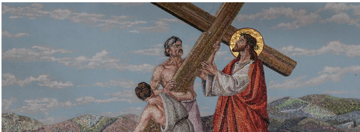
"Jesus takes up His Cross," Dominican Church of St. Pius V, Providence, RI