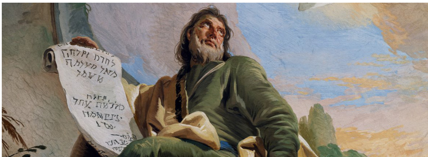
"The Prophet Ezekiel," Giovanni Battista Tiepolo, 18th cent., fresco, Patriarchal Palace, Udine, Italy