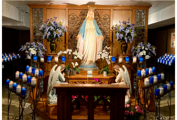
"Our Lady of Good Help," Shrine of Our Lady of Champion, Champion, WI

In other words, the spaces where we pray affect our prayer. Beautiful churches more easily lead the mind to see God, the One who is truly beautiful and perfect. Quiet places allow the mind to quiet itself so that it can engage in conversation with the Lord.