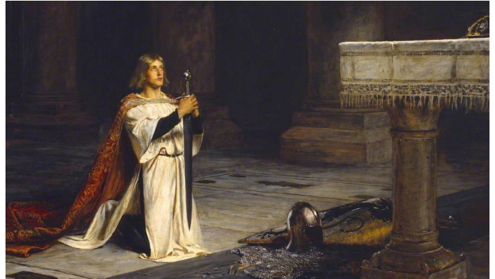
“The Vigil,” John Pettie, 1884, National Gallery, London

This is especially true of promises made to God. When we make a promise to God, we actually enter into a vow with Him, regardless of whether it is a private promise about fasting every Friday or a public vow like for a religious who makes vows of chastity, poverty, and obedience (cf. ST II-II, q. 88, aa. 1 and 2). Now when a person makes a promise is made to God, we “ought to be faithful to God above all, both on account of God’s sovereignty, and on account of the favors he has received from God. Hence he is obliged before all to fulfill the vows he has made to God, since this is part of the fidelity he owes to God” (ST II-II, q. 88, a. 3, corp. art.). Here, Aquinas insightfully points out that we should take promises to God even more seriously than we might make to our best friend or our boss. With promises made to God, the stakes are actually higher because He isn’t just more perfect. Rather, He is the all-perfect One to whom the highest honor and respect should be given.