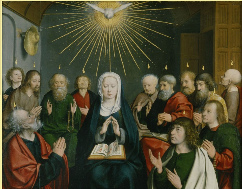
Jan Joest van Kalkar (c. 1450 – 1519). Pentecost (Pfingsten) 1505 – 1508