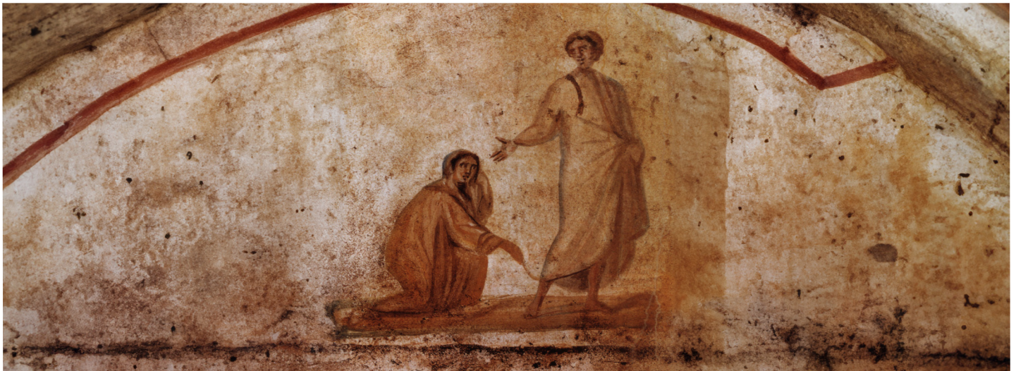
"Christ Healing the Bleeding Woman," Anonymous, 4th cent., fresco, Catacombs of Marcellinus and Peter, Rome. Edited scan from "The Art of Early Christianity," André Grabar, 1968, public domain.