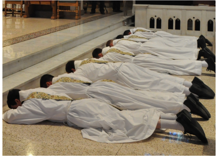
Dominican priestly ordination, 2014

Our varied actions while in church all reflect this. Why do we