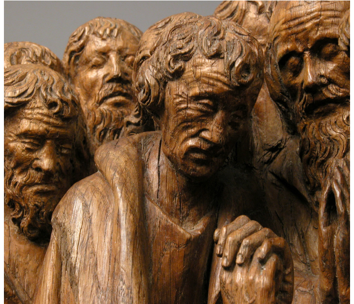
Detail of "The Apostles in Prayer," South Netherlandish, ca. 1400-1410, Metropolitan Museum of Art, New York

Recently, someone was describing to me what it was like to come to our Parish for the first time. He mentioned that it was striking to see so many people so deeply engaged in prayer—not just praying but deeply engaged in prayer. That is an insightful example of what devotion is. It doesn't have to look a certain way, and it doesn't mean that heads will be bowed all the time. Rather, it's an interior virtue that guides our prayer to go deeper so that we truly can surrender ourselves "readily to the service of God" (ST II-II, q. 82, a.