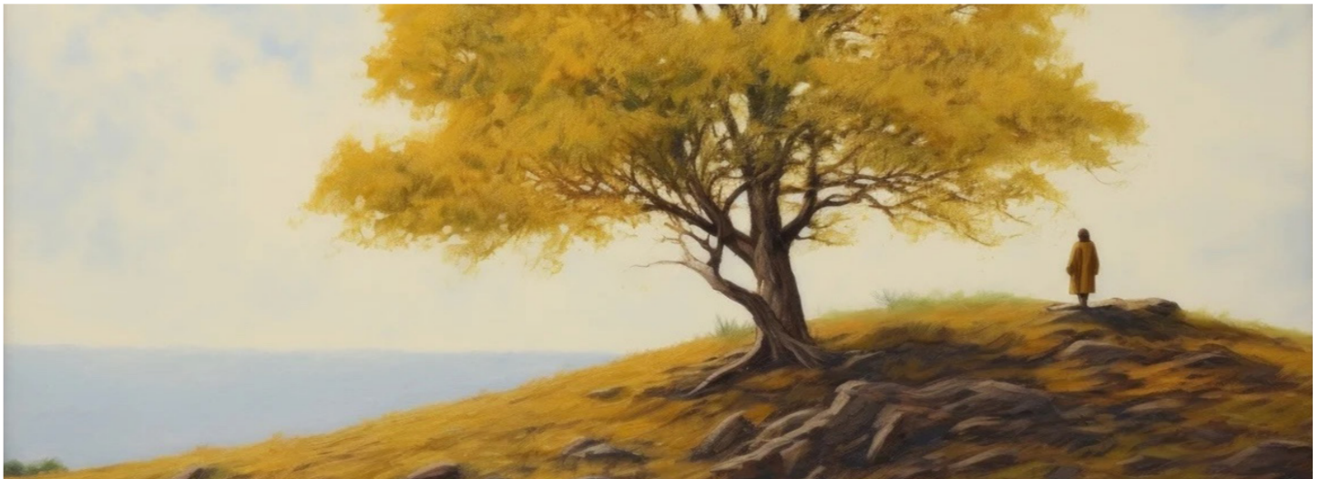
"Parable of the Mustard Seed," The Surrealists, Private Collection, London