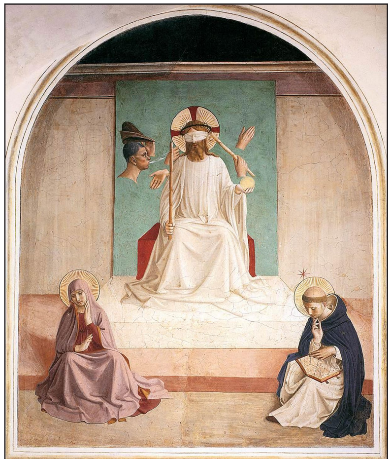
Bl. Fra Angelico, O.P., “The Mocking of Christ, with the Virgin and Saint Dominic,” 1439-1443, fresco, Cell 7, Convent of San Marco, Florence