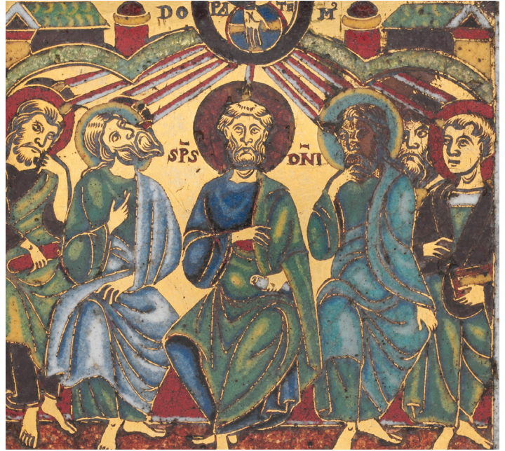
Plaque with the Pentecost, 12th cent., The Met Cloisters, New York

This leads us to Pentecost. Here on this feast, the Father and the Son sent the Holy Spirit down upon the disciples. Their hearts were enflamed with the love of God, and they went forth to proclaim the message of Christ to the whole world. Still, what were they doing before that? "All these devoted themselves with one accord to prayer, together with some women, and Mary the mother of Jesus, and his brothers" (Acts 1:14). They were in prayer.