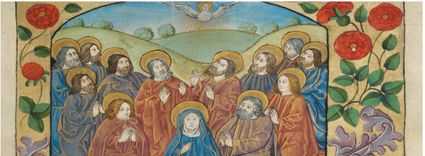
"Pentecost Descent of the Holy Ghost as a Dove," Vaux Passional, Anonymous, c. 1503-1504, National Library of Wales, Aberystwyth, Wales