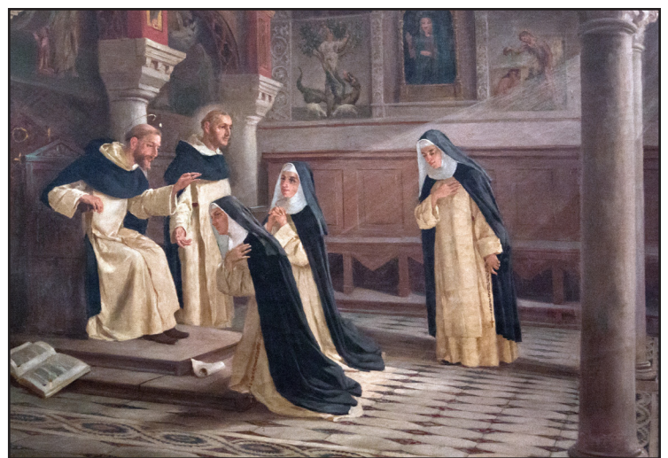
"Our Blessed Nuns," from the Dominican Nuns' Convent, Rome