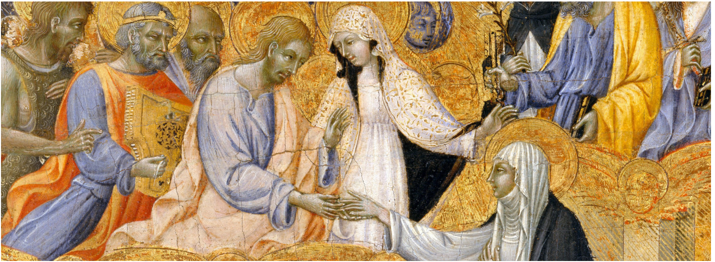
"The Mystic Marriage of St. Catherine of Siena," Giovanni di Paolo, The Metropolitan Museum of Art, New York, c. 1460