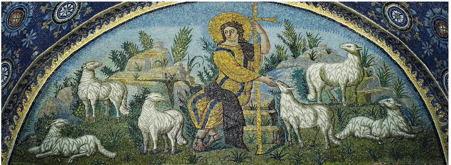
"The Good Shepherd," Mosaic, Mausoleum of Galla Placidia, Ravenna, Italy, c. 425.