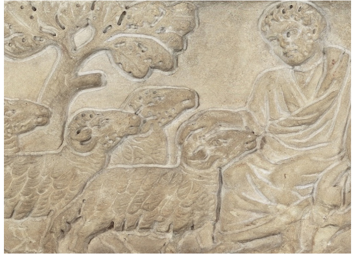
Sarcophagus Lid with Last Judgment, 3rd-4th Century, Metropolitan Museum of Art (Gallery 300), New York

With that in mind, I'd like to host two sessions on Sundays in