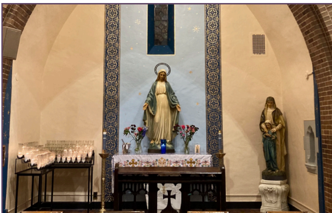
Mary Shrine at St. Catherine of Siena