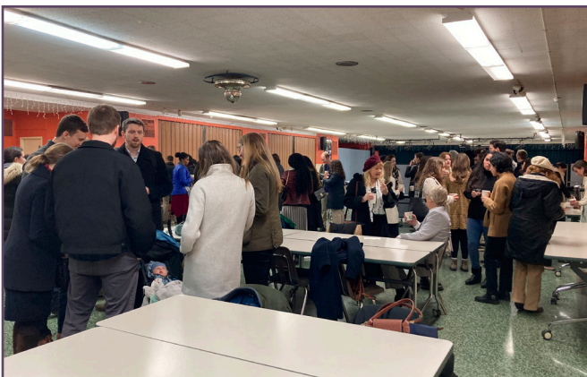
Parish Coffee Hour

Second, there is service to the Parish, which can be manifest in many ways. From assisting as lectors, servers, ushers, and money counters; to volunteering for the Parish Coffee Hour on Sundays; to providing expertise to help with