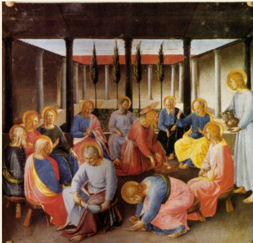
Washing the Disciples' Feet (Bl. Fra Angelico, detail from Armadio degli Argenti, San Marco, Florence)