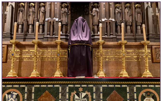
New Veils at St. Vincent Ferrer