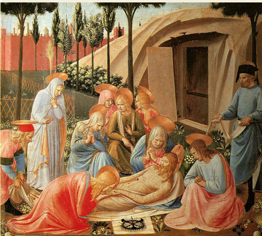
Christ Placed in the Tomb (Bl. Fra Angelico, detail from Armadio degli Argenti, San Marco, Florence)

The title "Maundy" Thursday is derived from the ceremony of the washing of feet, the Mandatum , so called because of the incipit of an Antiphon sung during that ceremony: Mandatum novum do vobis (I give you a new commandment.) (John 13:34). The Mandatum takes place on this day because the Lord washed the feet of his Apostles before the Last Supper.