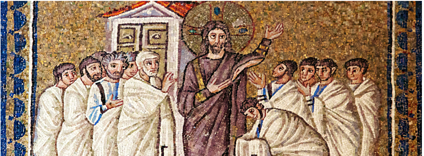
"The Risen Jesus appears to the disciples in the Upper Room," Mosaic, Sant' Apollinare Nuovo, Ravenna, Italy