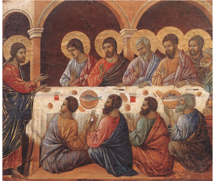
"Appearance while the Apostles are at Table," Duccio di Buoninsegna, 1308-1311, Museo dell'Opera Metropolitana del Duomo, Siena

Even more profound than this, though, is that once we've experienced the peace with which the Lord desires to flood our hearts, it's almost as if we'll be impelled to share what we've found. This is what we see in the woman at the well, St. Mary Magdalene on Easter morning, and the apostles after Pentecost. Once Christ comes to dwell within us and fills us with His peace, how could we not want others to experience that peace as well? Naturally, we will be moved to preach the resurrection, repentance, and the forgiveness of sins like He invites us to do in today's Gospel.