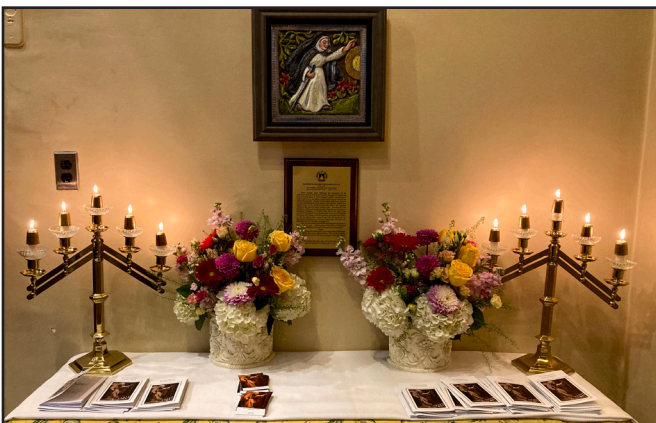
Celebration of the Canonization of St. Margaret of Castello, O.P. in September

With the fruits also come the practical realities, which are twofold. The first is about continuing to expand our hospitality to new parishioners, guests, and those who maybe only come a few times each year. Sometimes this means that people will sit in your normal seats. If you see a new face or someone whom you haven't seen in a