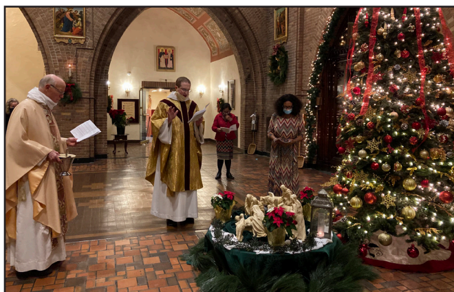
Blessing of the Christmas Crèche on the Nativity of the Lord