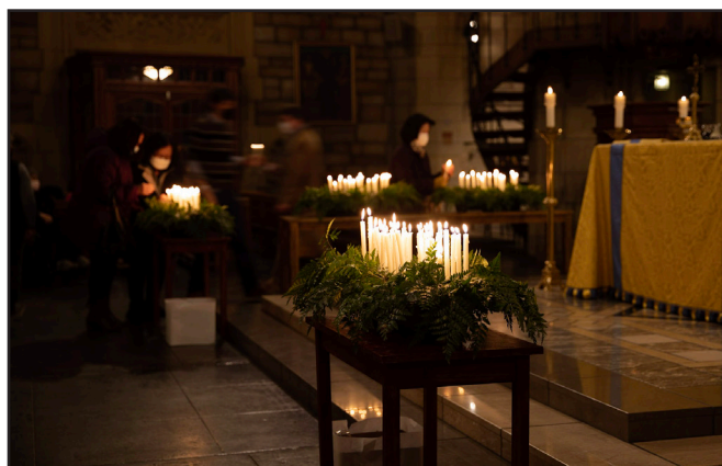
Candlemas Offertory Procession with Lighted Candles