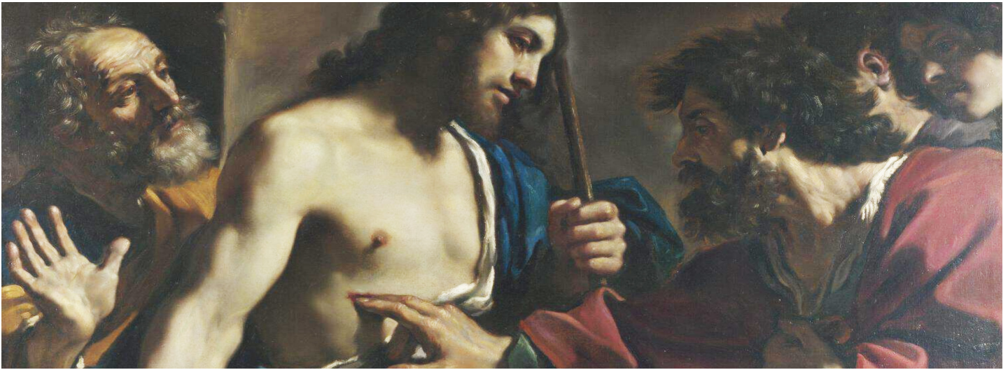
"The Incredulity of Saint Thomas," Guercino, 1621, National Gallery, London