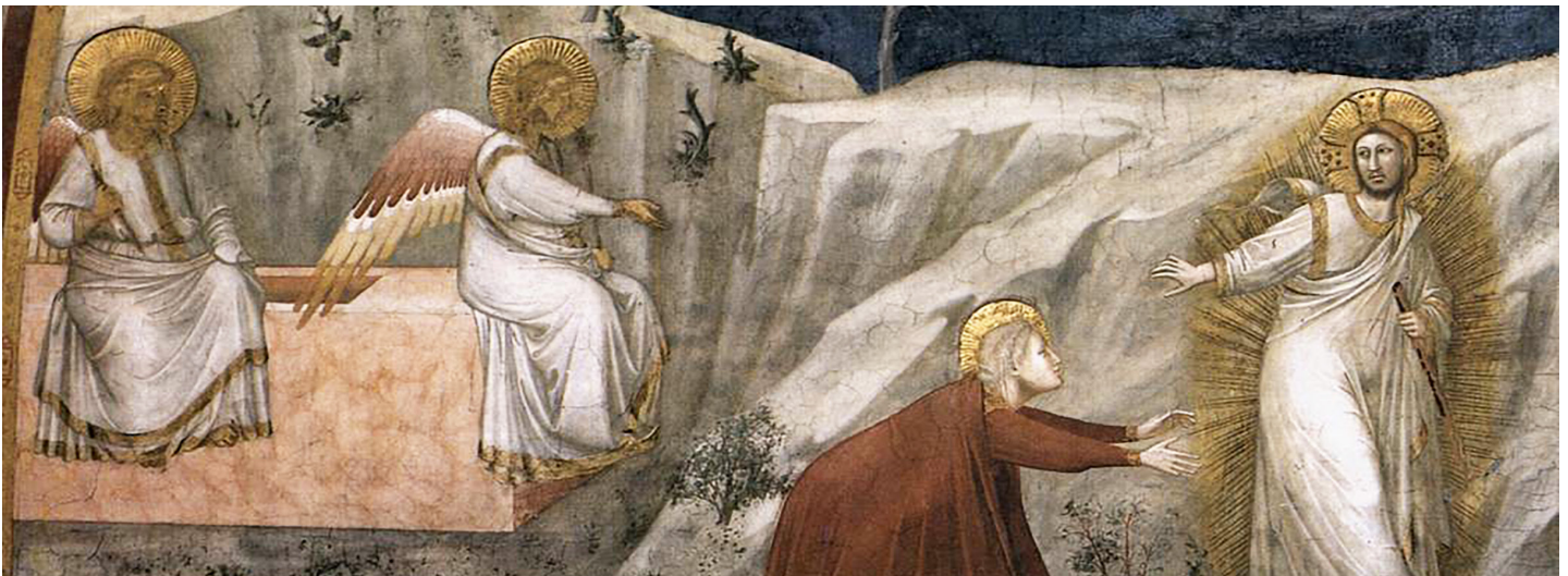
"Noli me Tangere," Giotto, 1320, Basilica of St. Francis, Assisi