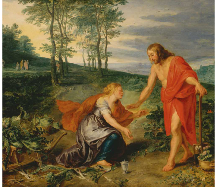
“Christ Appears to Mary Magdalene on Easter Morning,” Peter Paul Rubens and Jan Brueghel the Younger; 1626, Kunsthalle Bremen Museum, Bremen, Germany

All of this should truly lead us to live in a whole new way. Drawing on St. Augustine, St. John Paul II famously said, “We are an Easter people” (Angelus, 30 November 1986). This beautifully encapsulates something we see in the Easter Masses: “Paschal joy.” In the Preface during Mass throughout the entirety of the Easter season, the Church invites us to live with Paschal joy, the joy that comes from the reality of the resurrection. This is a joy that should well up in our hearts because if Jesus rose from the dead, then He can conquer everything. He can conquer sin in our lives, He can conquer fear and doubt that come with terminal sicknesses, He can conquer scrupulosity, He can conquer all forms of attacks by the evil one and his minions, and He can conquer each and every challenge that we experience. Since Jesus rose from the dead, we can live in a whole new way where we place all our hope and trust in Him. For just as He rose from the dead so too does He want to raise us up from those things that would seem to weigh us down or