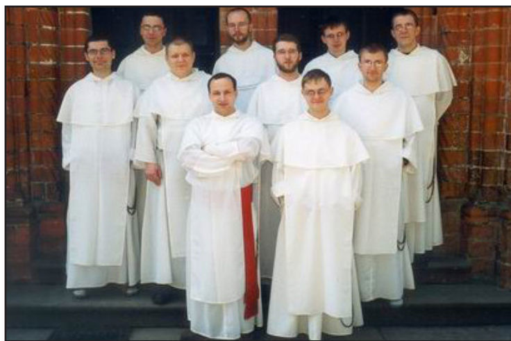
Because of the martyrdom of Bl. Sadoc and his companions, the Polish Dominicans have been given permission to wear a red cincture at their waist.