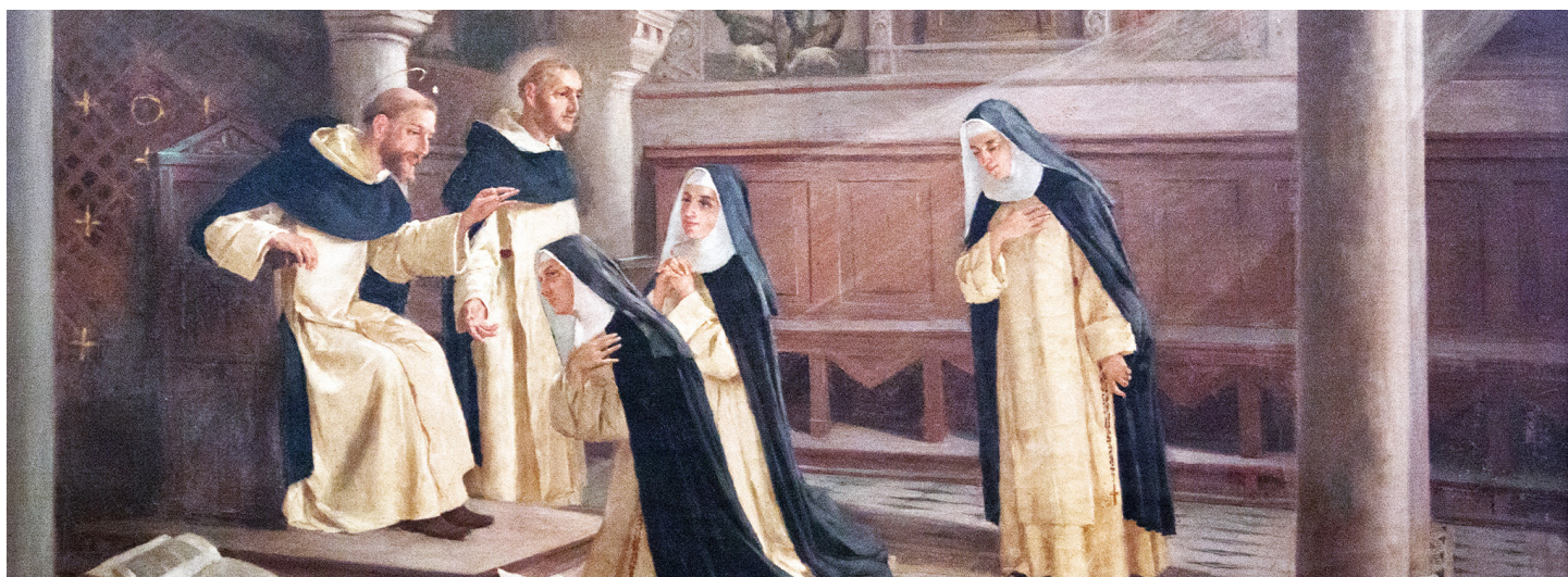
World Day of Consecrated Life : "Our Blessed Nuns," Dominican Nuns' Convent, Rome