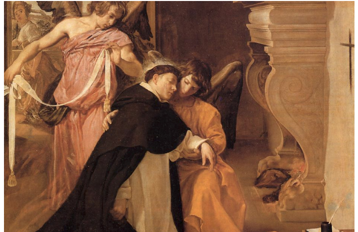
"Temptation of St. Thomas Aquinas," Diego Velázquez, 1631-1632, Museo Diocesano de Arte Sacro, Oribuela, Spain

This isn't just about intellectual prowess though. This also reveals a heart that can be dedicated to one thing and to one thing only: God Himself. This moment in which Thomas sought to defend his vocation and the purity of his heart actually became the moment