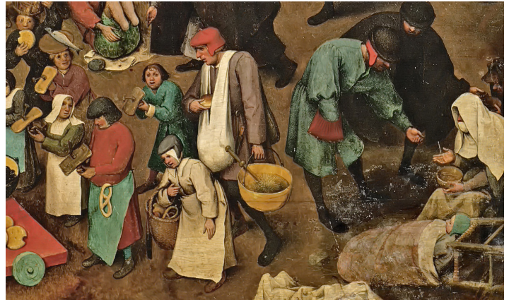
Detail of: "Battle between Carnival and Lent," Pieter Bruegel the Elder, 1559, Kunsthistorisches Museum, Vienna

What does it mean to have intentions for Lent? What we normally do for Lent should be about both turning away from sin and turning toward God. The fasts, abstinences, almsgiving, and prayers are all meant to lead to a life of holiness. One thing that can be such an aid to this is to have an intention behind what we do. For instance, if our Lenten practice is to pray the Rosary every day, having someone to offer it for—say an aunt who is sick with cancer—can make it