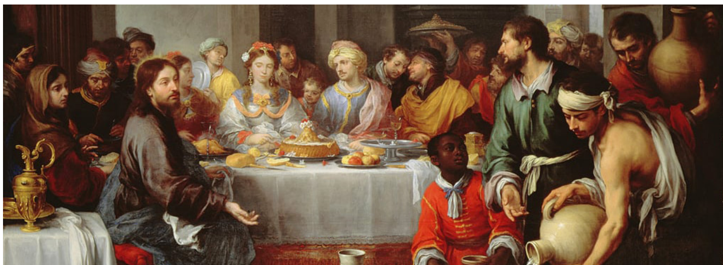
World Marriage Day - "The Marriage Feast at Cana," Bartolome Esteban Murillo, c. 1672, Barber Institute of Fine Arts, Birmingham, UK, on loan to the Metropolitan Museum of Art, New York