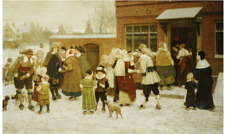
"New Year's Day, New Amsterdam, 1876," George Henry Boughton, 1876.

When we fail to do one of these things, though, we fail to live up to the minimum that God and the Church ask us to do to prepare for heaven. We fail to follow through with the principal means for the conversion of our minds and hearts. This often leads us to trust in ourselves, rather than God, as the source of our salvation because we think we know better regarding what we actually need for heaven. That is why failing in any of these ways is a grave sin.