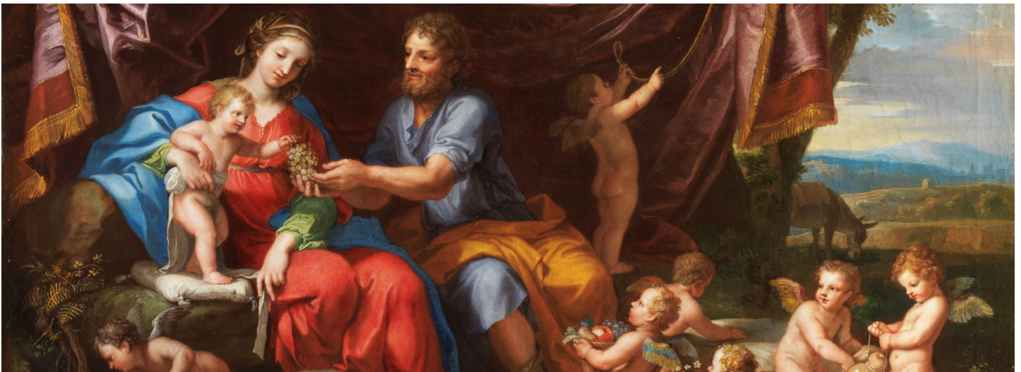
"Holy Family - The Rest on the Flight to Egypt," Jacques Stella, 1652, Museo del Prado, Madrid