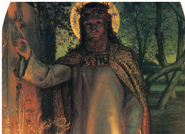
"The Light of the World," William Holman Hunt, 1851, Keble College, Oxford

For Easter: Christ's rising from the dead is a witness to faith, hope, and charity. What can I do to grow in each of these virtues this Easter season?