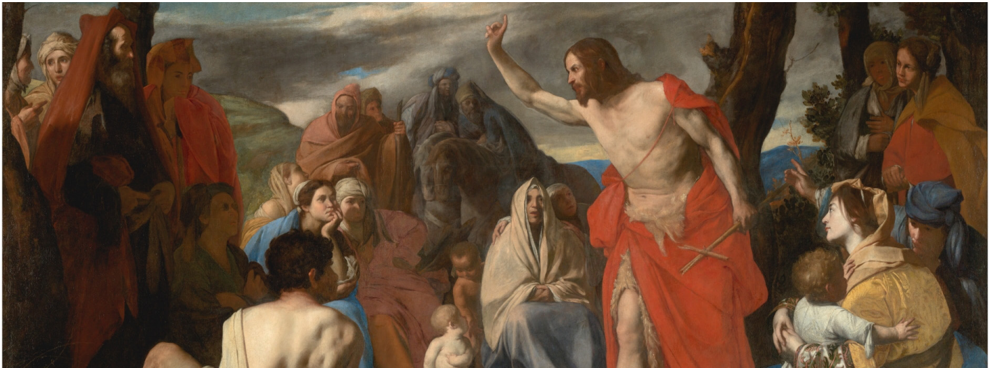
"The Preaching of St. John the Baptist," Massimo Stanzione, ca. 1635, Prado Museum, Madrid