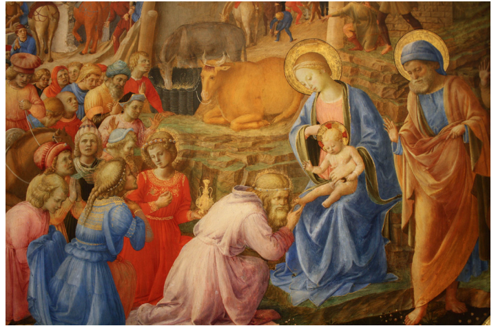
“The Adoration of the Magi,” Fra Angelico, c. 1440-1460, National Gallery of Art, Washington, D.C.

Our Advent Novena is offered on behalf of the most vulnerable in our society—our children. Beginning on December 17 and concluding on Christmas Day, we will pray in common for their safety and wellbeing. This includes every child from conception