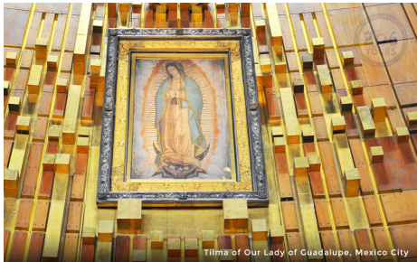
Tlaxcala of Our Lady of Guadalupe, Mexico City