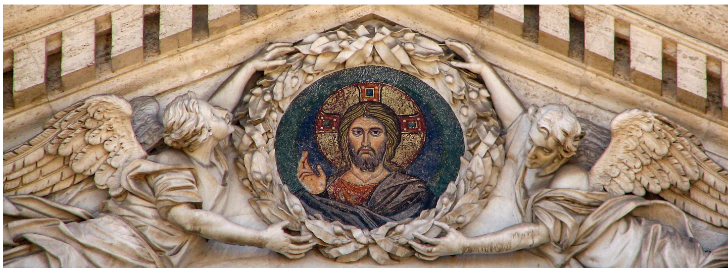
"Christ the Savior" Facade, Lateran Basilica, Rome