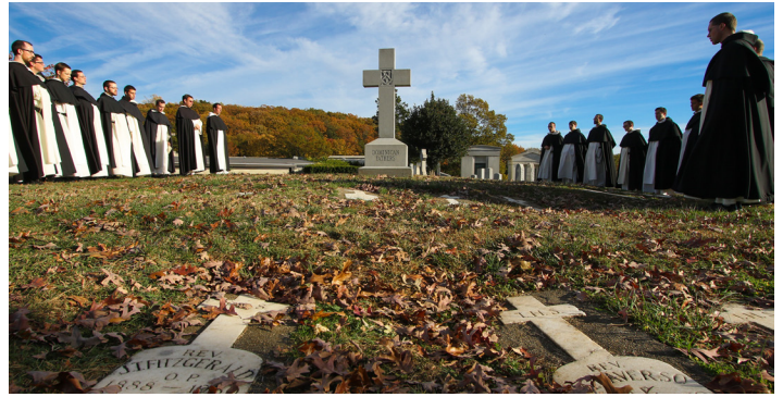
"Prayers for our Deceased Brethren," Dominican Cemetery Plot, Washington, DC

This can be especially helpful if we never had the chance to come to closure or to reconcile with a particular person. Sometimes, at the