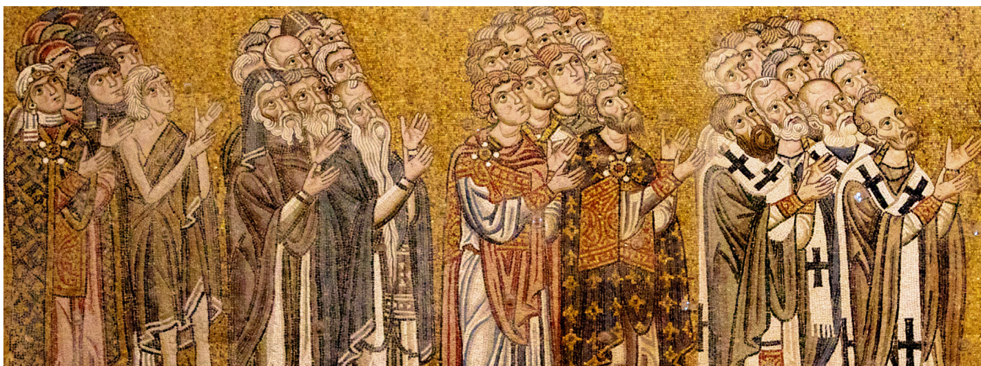
"Virgins, Monks, Martyrs, Confessors," 12th cent., Mosaic Detail, Santa Maria Assunta, Torcello.