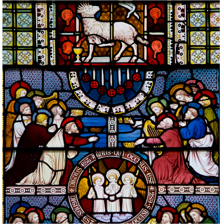
"Worthy is the Lamb that Was Slain," Grenadier Guards' Chapel, London, This stained glass window depicts Revelation 5:6-10, which describes the adoration of the Lamb of God by the saints and angels in heaven.

Gates gilded in fire-tried gold Amidst walls fashioned from gems so rare Causeways of glittering glass, crystal wrought To the noble throne hewn from celestial stone Joy and gladness all surrounded Trumpets sound and horns ablaze for the Lord Martyrs' palms fresh with life Virgins' lilies spotless bright White-robed witnesses, a saintly throng Heavenly hierarchies, angelic songs Gathered round the Lamb alive anew Enveloped in royal robes how crimson-white To Him are we called