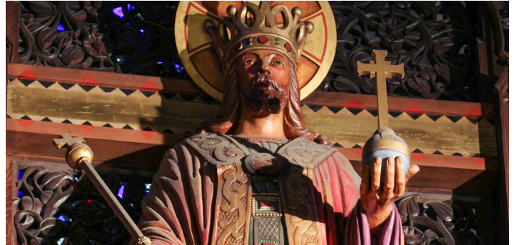
"The Lord is King with Majesty Enrobed," St. Vincent Ferrer Church, New York

Even amid a variety of struggles in our lives, there is still so much for which we can be thankful. This week is an opportunity to thank all those who have helped us grow in our faith. It's a wonderful chance to express our gratitude to them for helping us choose Christ as our King. Even if it's been a long time since you've last spoken with them, or even if you've never shared something like this with