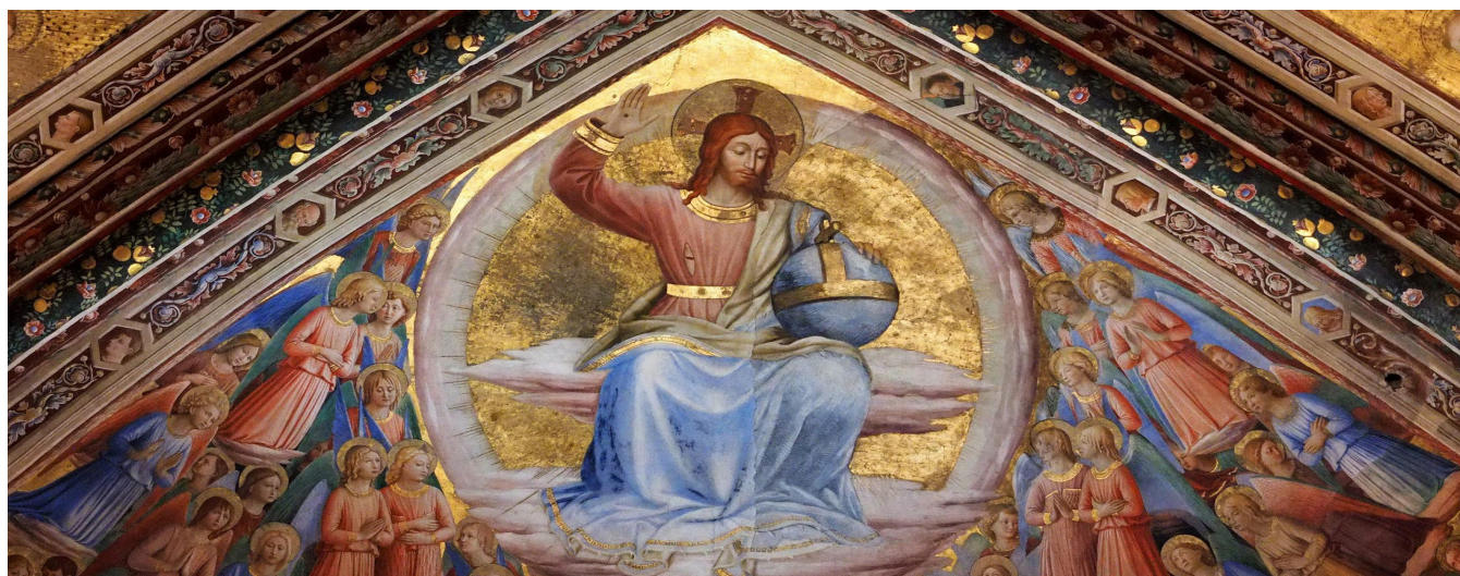
"Christ as Judge," Bl. Fra Angelico, 1447, Capella di San Brizio, Duomo di Orvieto, Italy