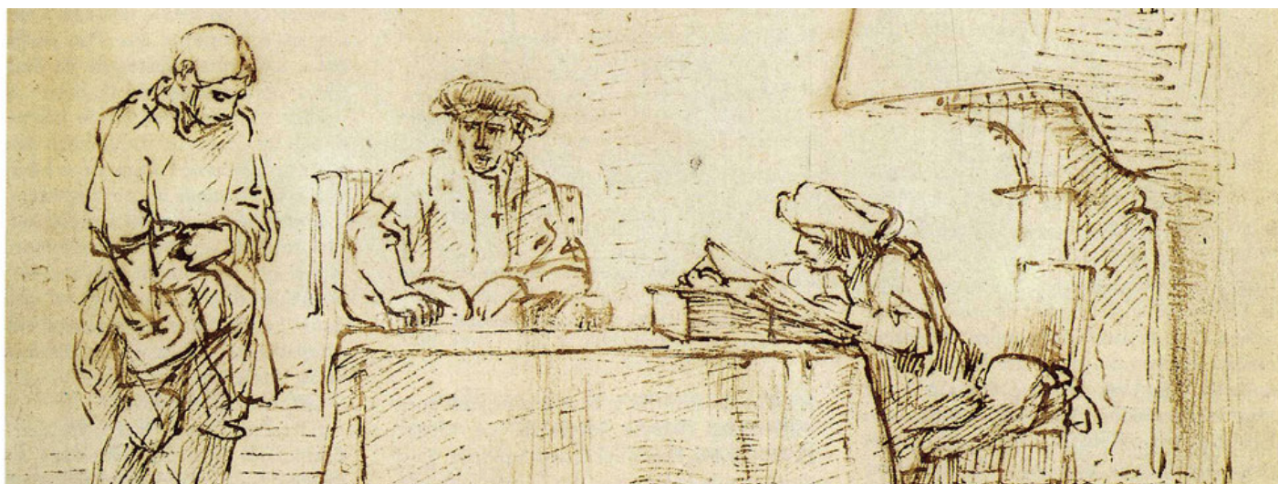
"The Parable of the Talents," Rembrandt, c.1652, Louvre, Paris