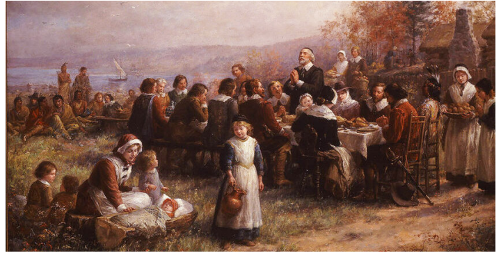
"Thanksgiving at Plymouth," Jennie Augusta Brownscombe, 1925, National Museum of Women in the Arts, Washington

Is not this the heart of Thanksgiving? With all the beautiful aspects of the day, sometimes mixed with some interesting family interactions, at times the football can obscure gratitude and the menu can supersede the Lord. At its heart, though, Thanksgiving Day should be a day of thanksgiving, in which we give thanks to almighty God for His generous graces. In so many varied ways, the Lord lovingly bestows His gifts upon us. Whether it is an increase of a particular virtue, the generous smile of a passerby when we're having a rough day, a word of encouragement from a friend that comes right when we need it, making it onto the subway just before the doors close,