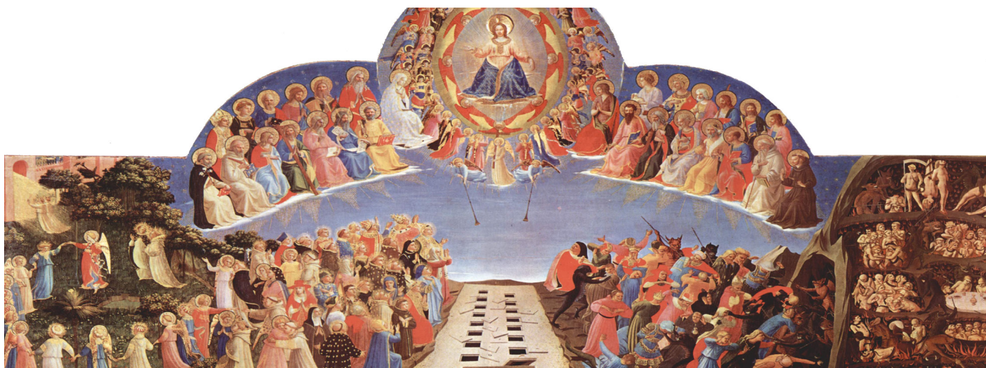
"The Last Judgment," Bl. Fra Angelico, circa 1425-1430, tempera on panel, San Marco, Florence