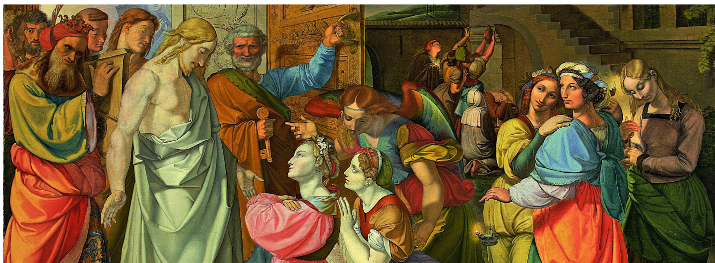
"The Parable of Wise and Foolish Virgins (unfinished)," Peter von Cornelius, 1813-1816 Museum Kunstpalast, Düsseldorf