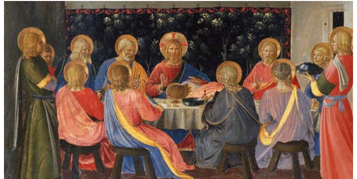
"Last Supper", Bl. Fra Angelico, detail from Armadio degli Argenti, San Marco, Florence

Our Sunday gathering around the celebration of the Word of God and our being nourished on the Body and Blood of Christ must be our moment each week to express gratitude to Almighty God. We read regularly in the Catholic press that the number of believing and practicing Catholics is declining rapidly for one reason or another.