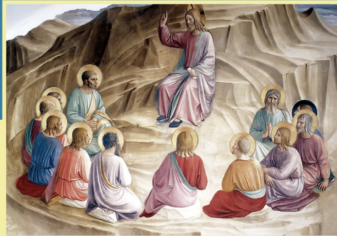
"THE SERMON ON THE MOUNT," BL. FRA ANGELICO, 1436-1443, MUSEO DI SAN MARCO, FLORENCE

TUESDAYS from SEPTEMBER 27 TO OCTOBER 25 at 6:45 PM in the LOWER CHURCH at ST. VINCENT FERRER.