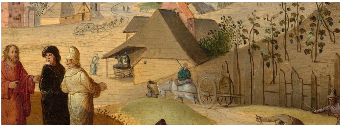
"Allegory of October," with the inscription MATT 21, Abel Grimmer, 1609, private collection