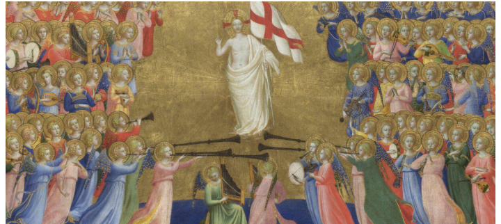
"Christ Glorified in the Court of Heaven," Bl. Fra Angelico, O.P., National Gallery, London

Finally, there was the Angelic Warfare Confraternity. I joined the Confraternity while in college, and I am so grateful that I did. The Confraternity is a spiritual community in which all the members pray for each other and partake of the graces of the Dominican Order for their own growth in chastity and purity of heart. This wasn't just powerful in my life, but I was able to see how the prayers were so instrumental in leading others to a deeper place of purity. Through