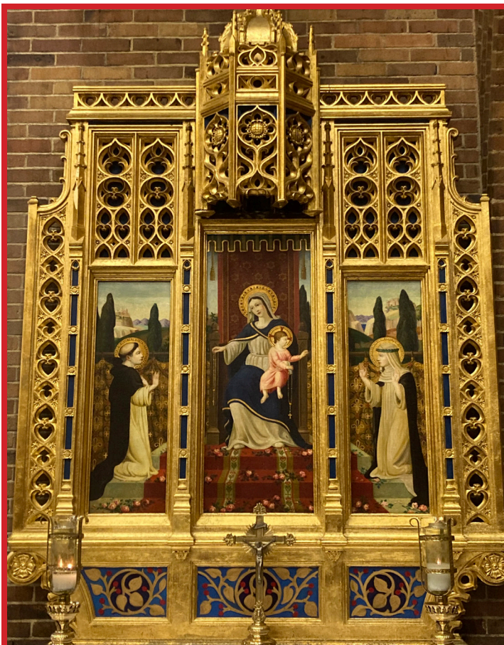
ROSARY ALTAR ST. CATHERINE OF SIENA