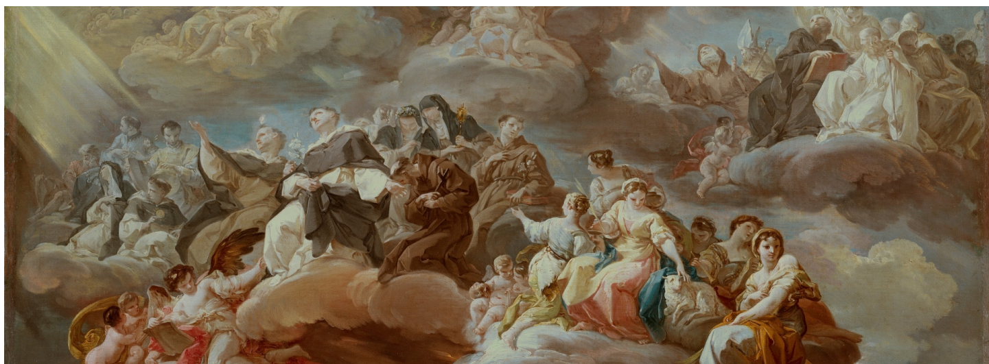
"Paradise," Giaquinto Corrado, 1754-1757, Museo Nacional del Prado, Madrid