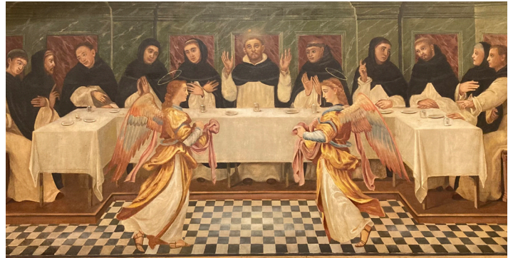
“Miracle of the Bread,” St. Vincent Ferrer Priory, New York

On the one hand, your donations to the Annual Friar Formation Appeal can benefit the Parish since some of these brothers will come here in the future in various capacities. They will be the ones saying