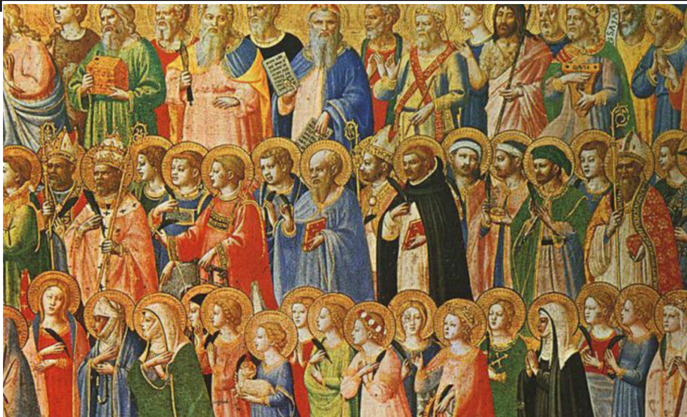
"The Forerunners of Christ with Saints and Martyrs," Bl. Fra Angelico, National Gallery, London