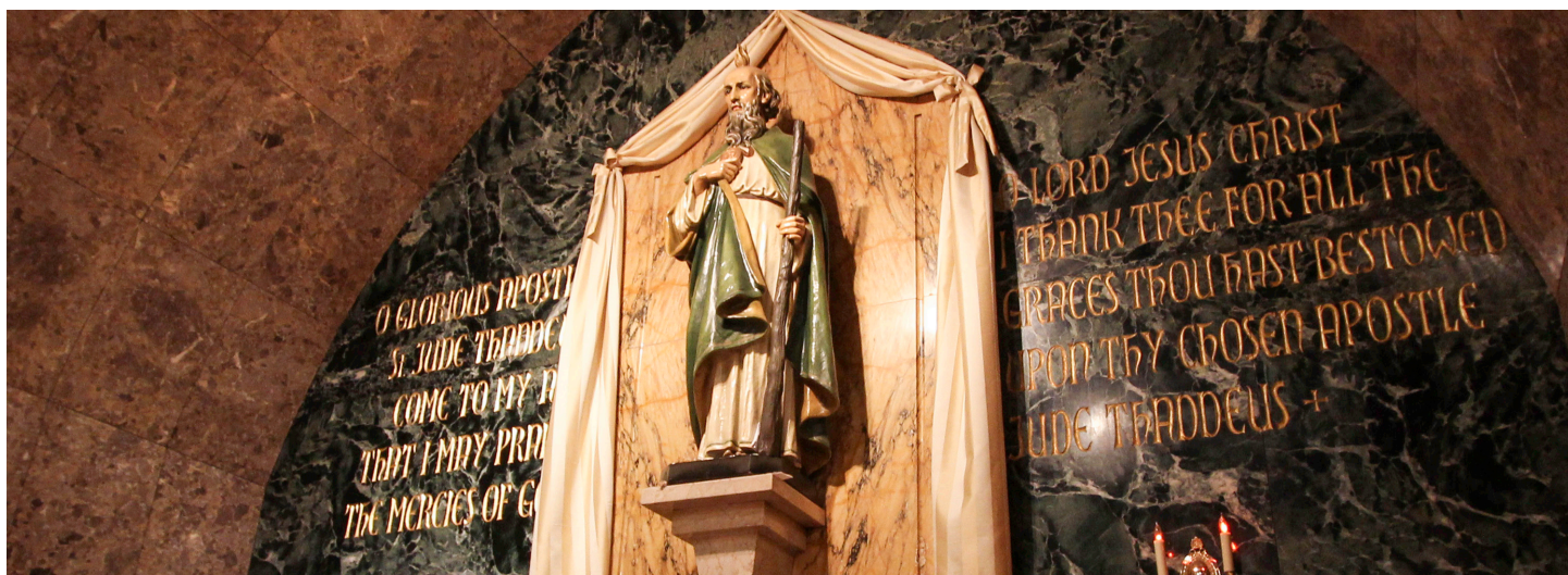
Shrine of St. Jude, Church of St. Catherine of Siena, New York City