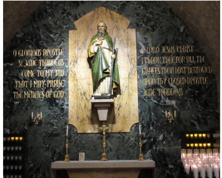
Dominican Shrine of St. Jude St. Catherine of Siena

The apostle Jude or Judas, also called Thaddeus, is identified as the brother of James who is regarded as St. James the Less. We know nothing of his call to be a disciple of Christ. He is first mentioned in the gospels when enumerated among the apostles. The history of St. Jude after our Lord's ascension and the descent of the Holy Spirit is unknown. He may have preached both in Palestine and Persia, and he has become known as the patron of those in despair or in hopeless situations. Perhaps this reference came about because of the similarity of his name with that of Judas Iscariot, who betrayed Jesus and despaired. Many patrons of the Shrine of St. Jude come to him in prayer as patron of impossible cases, which in the medical profession might well indicate perplexity on the part of doctors which leaves family at a loss.