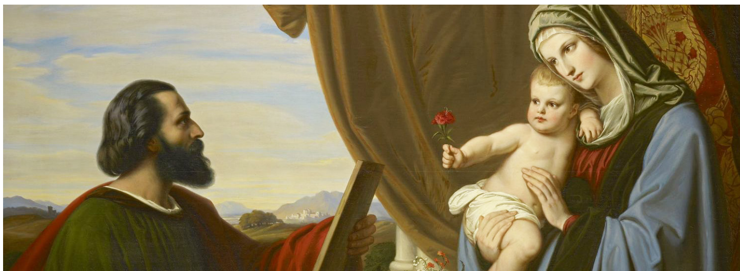
"St. Luke Painting the Virgin," Eduard Jakob von Steinle, 1851. Royal Collection Trust, London