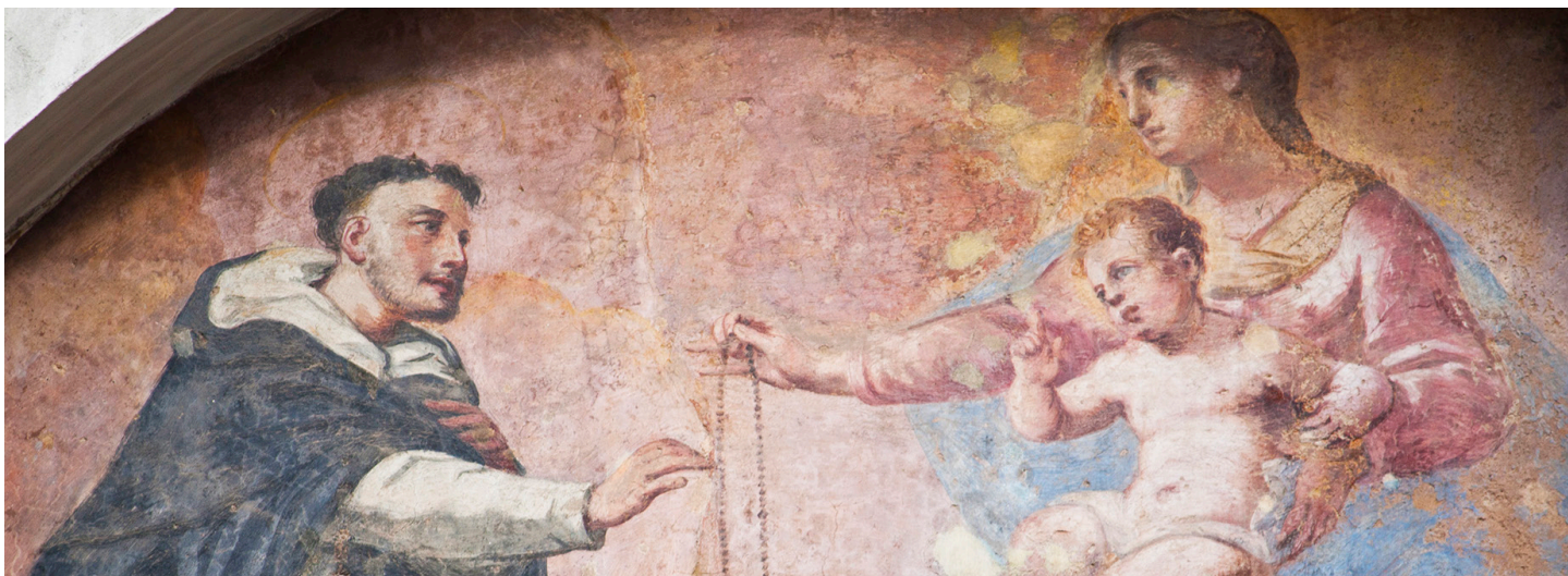
"Our Lady gives the Rosary to St Dominic," frescoed tympanum, Santa Maria sopra Minerva, Rome