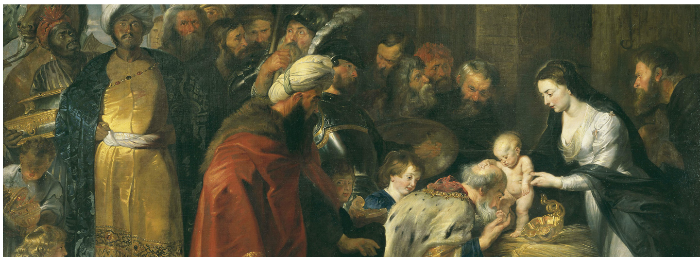
"Adoration of the Magi," Peter Paul Rubens, 1617-1618, Museum of Fine Arts, Lyon