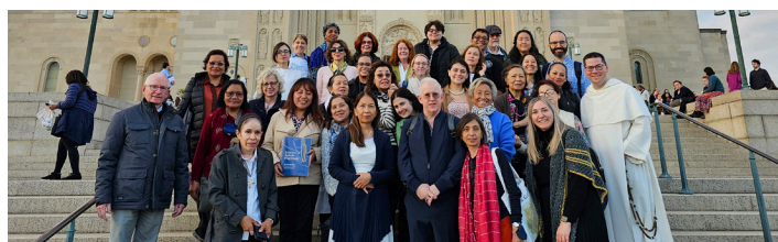
Top: 125 th Anniversary of the Dominican Ministry at St. Catherine of Siena; Middle: Holy Family Atrium for CGS at St. Vincent Ferrer; Bottom: National Dominican Rosary Pilgrimage in Washington, DC