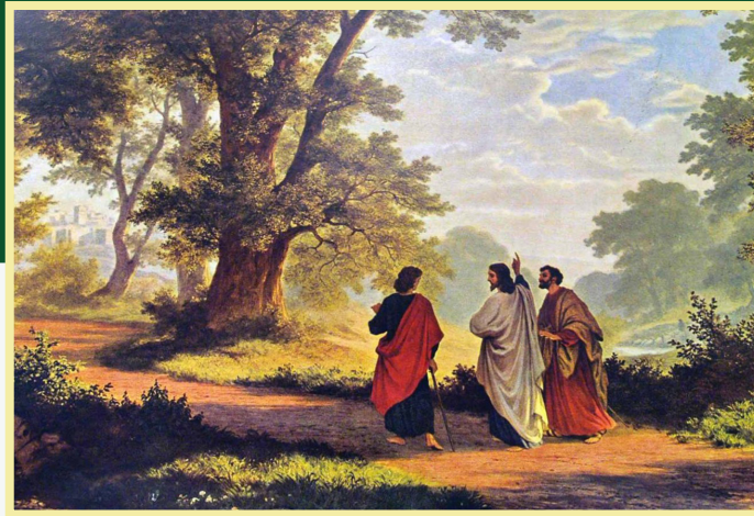
Road to Emmaus," Robert Zünd, 1877, St. Gallen Museum of Art, St. Gallen, Switzerland

MONDAYS from JANUARY 9 to FEBRUARY 20 at 7 PM in the PARISH CENTER at ST. VINCENT FERRER