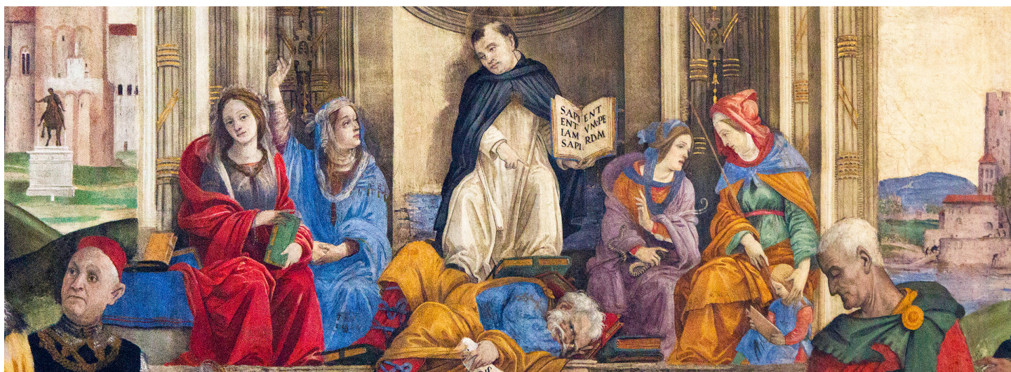
"Triumph of St. Thomas," Fra Filippino Lippi, 1489-1491, Santa Maria sopra Minerva, Rome