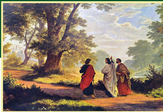
Road to Emmaus," Robert Zünd, 1877, St. Gallen Museum of Art, St. Gallen, Switzerland

MONDAYS from JANUARY 9 to FEBRUARY 20 at 7 PM in the PARISH CENTER at ST. VINCENT FERRER