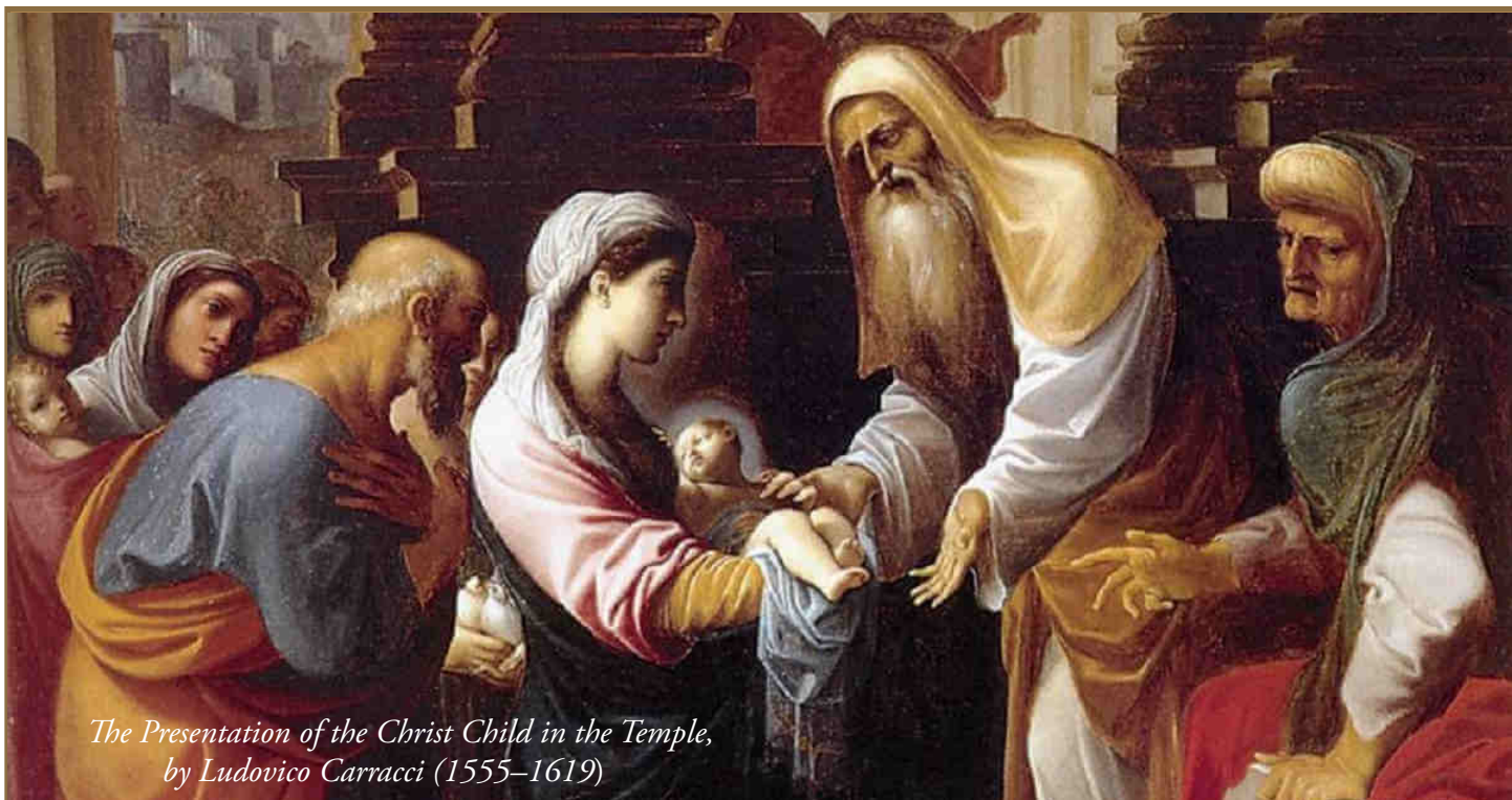
The Presentation of the Christ Child in the Temple, by Ludovico Carracci (1555–1619)