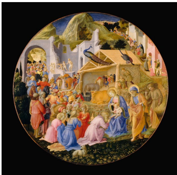
"Adoration of the Magi," by Bl. Fra Angelico, O.P., ca. 1440, National Gallery of Art, Washington, DC