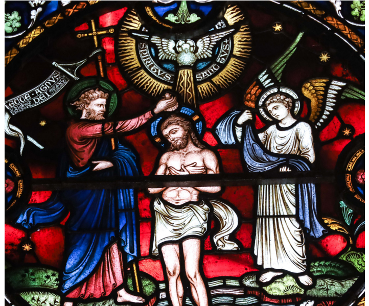
"Baptism of the Lord," stained glass window, Salisbury Cathedral

Just like a proud father standing on the sidelines and cheering on his children, God the Father gazes down upon us and sees us as