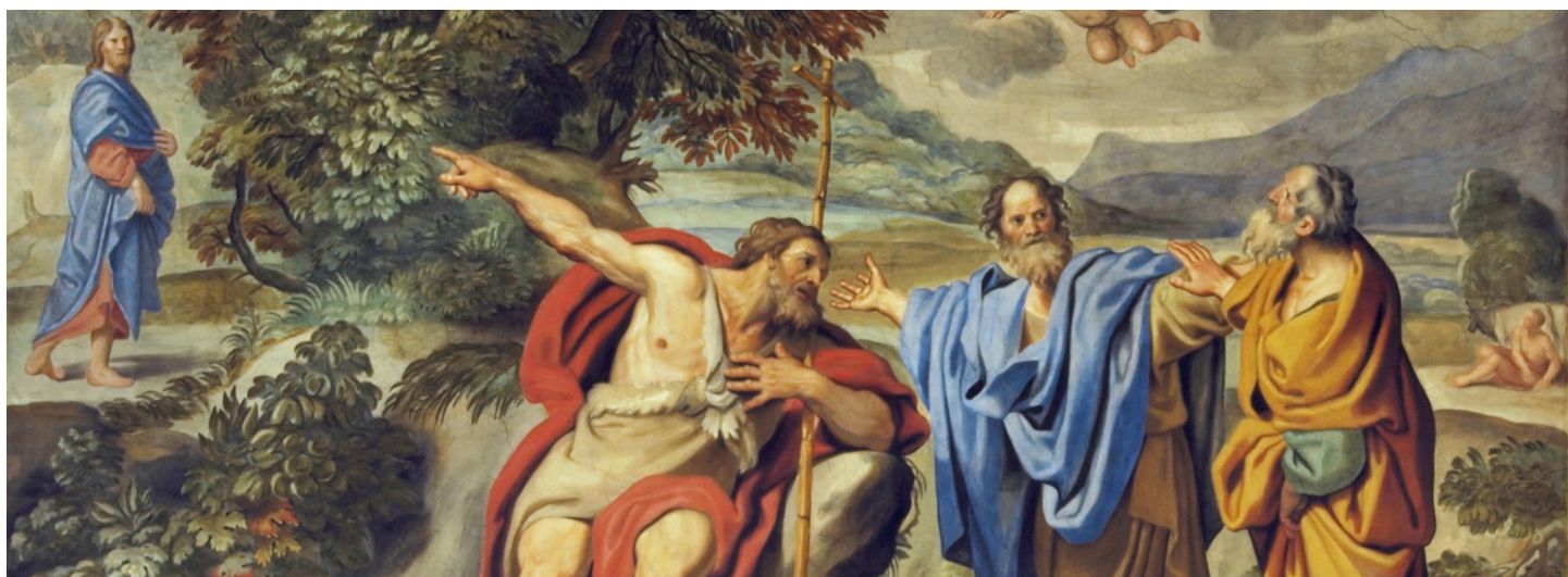
"St. John the Baptist shows the Christ," Domenichino, 1621-1628, Basilica di Sant'Andrea della Valle, Rome