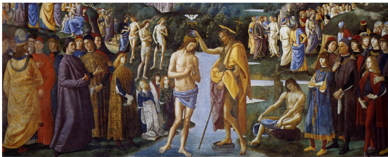
"Baptism of Christ," Pietro Perugino, 1482, fresco, Sistine Chapel, Vatican City