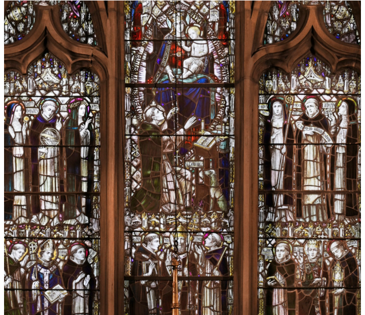
Detail of the Friars' Chapel Window, St. Vincent Ferrer Church, New York City