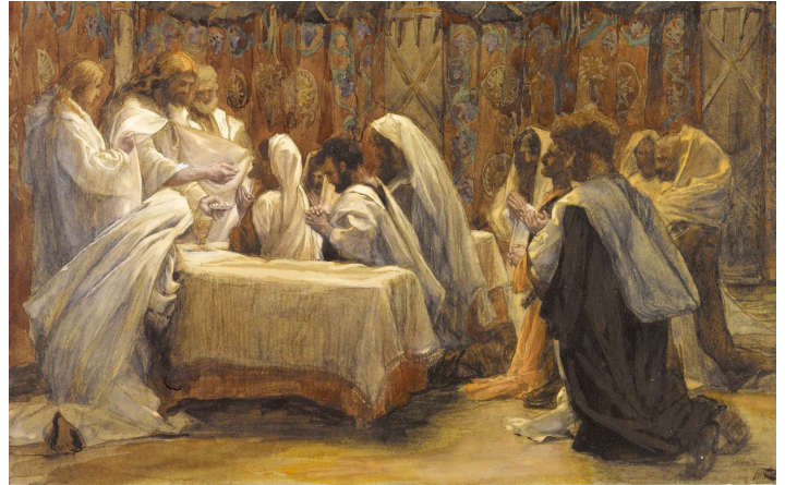
"The Communion of the Apostles," James Jacques Tissot, 1884-1896, Brooklyn Museum, New York

Upon the request of the Archbishop of New York, the late Patrick Cardinal Hayes, the Vatican's Sacred Oriental Congregation in