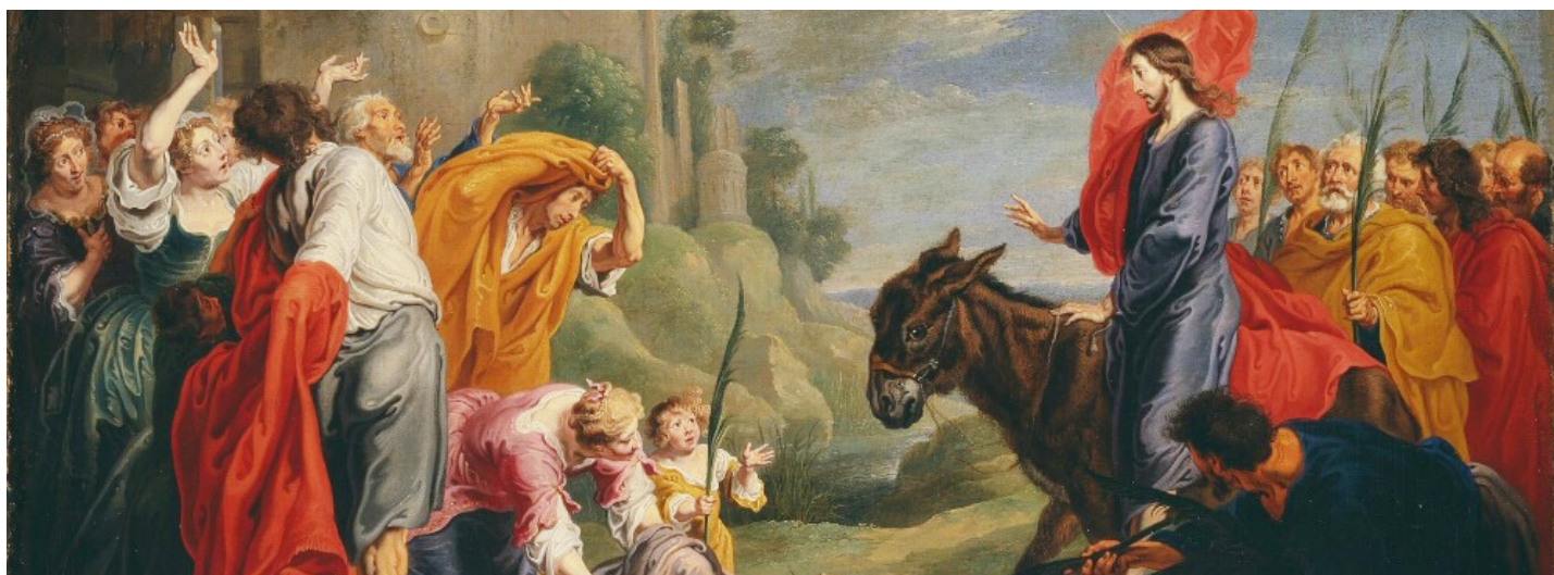
"The Entry into Jerusalem," Willem van Herp, mid to late 17th cent., National Museum, Stockholm, Sweden