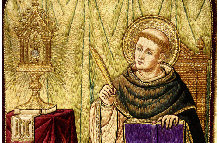
"St Thomas Composing," detail from an embroidered cope, Dominican Sisters of Stone, Staffordshire

I just want to draw out one of these texts, one that is so dear to the Dominicans: "O sacred banquet, in which Christ becomes our food, the memory of His Passion is celebrated, the soul is filled with grace, and the pledge of future glory is given to us." In this Vespers antiphon, St. Thomas so beautifully encapsulates a rich Eucharistic theology that also is meant to lead us to heaven. Here, the Eucharist is described as a "sacred banquet." This is a foreshadowing, "a pledge" of the future eternal banquet of heaven, in which all the saints participate and in which we enter in some way when we come to the Mass. For there, "Christ becomes our food," the food